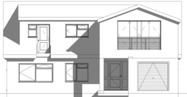
South Elevations Existing